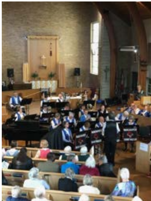
The Dorfmusik played Marches, Polkas and Waltzes.

We had lots of fun with the gift baskets (thank you to all the contributors from the choir and the Dorfmusik) distributing them to the winners and all enjoyed the food and socializing.