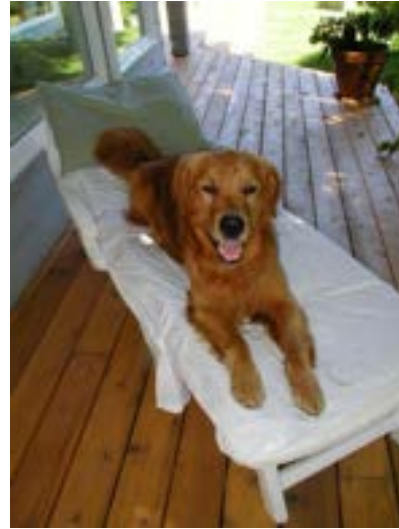
Can you see the dog?