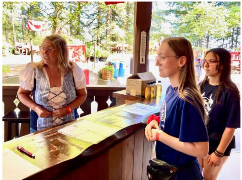
Selling food/drink tickets kept volunteers very busy