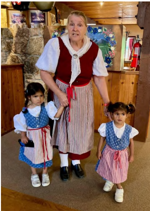
Two very proud and devoted grandmas