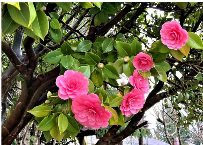
Waiting for Spring after all that snow