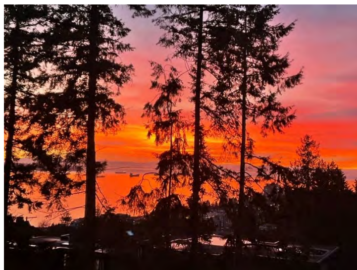
January 10, 2023 View from West Vancouver No Photoshop!