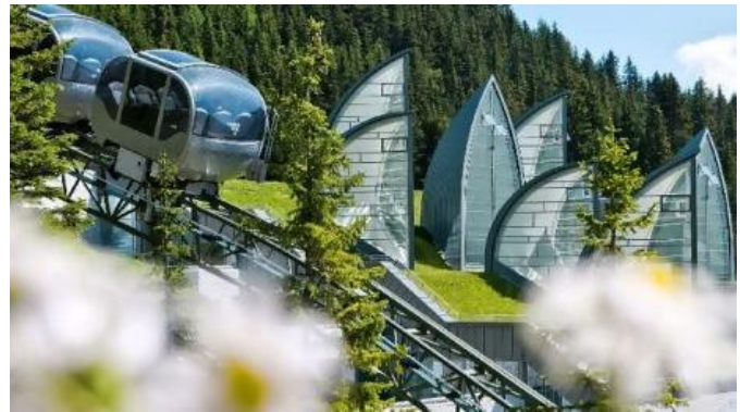
Tschuggen Express, a small train that looks like a posh roller coaster, zips past the Tschuggen Grand Hotel in Arosa, Switzerland.