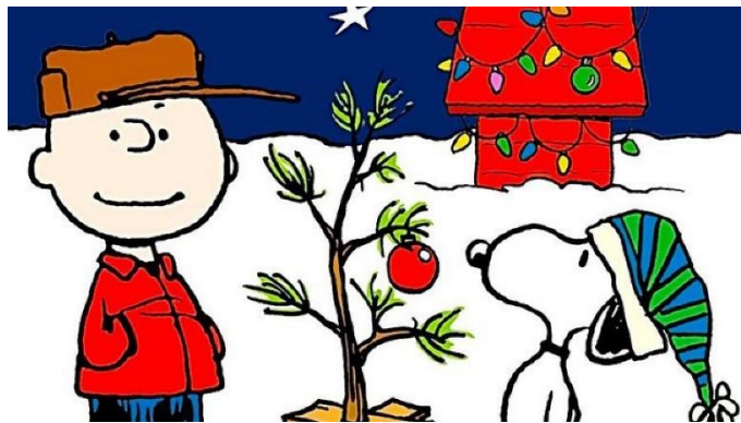
Charlie Brown's Christmas Tree