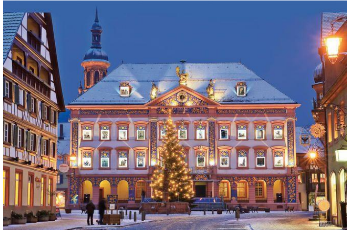
Real Life Advent Calendar in Gengenbach Germany