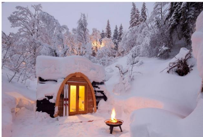
New way of camping in Flims, Switzerland