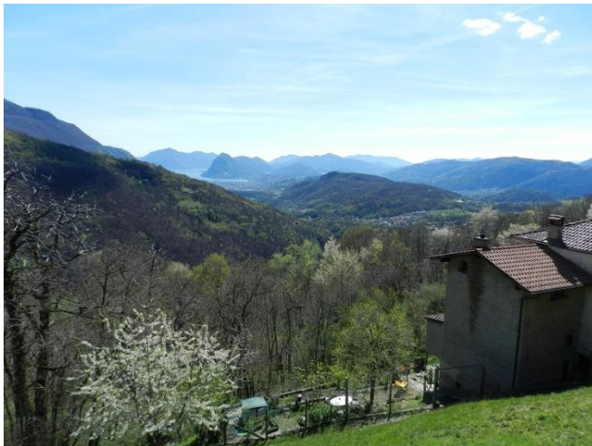
Spring 2014 in Switzerland