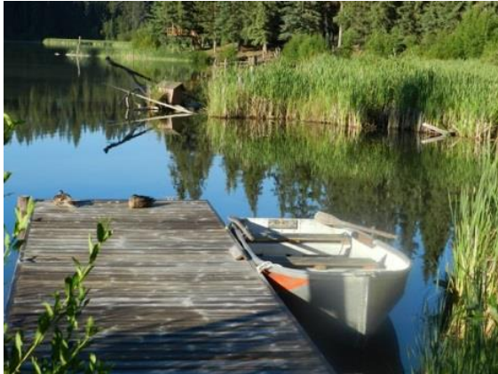
Early morning at Fawn Lake