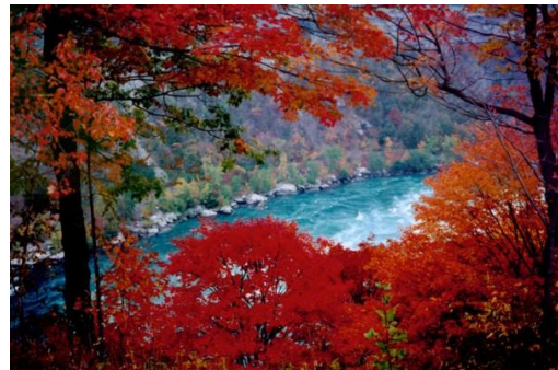
Autumn in Niagara Falls (C.Lips)