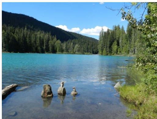
Cheakamus Lake near Whistler