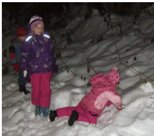
2011 Waldweihnacht Outing!