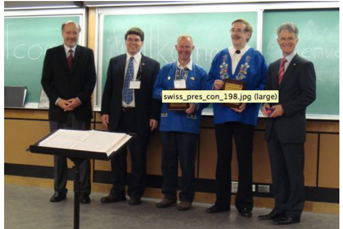
Presidents Conference in 2007