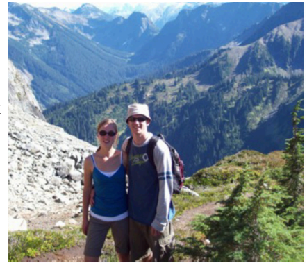
Lilting Mount Junker, September 2009