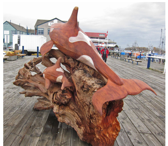
Above is a beautiful wood carving of a whale and her calf on the docks...