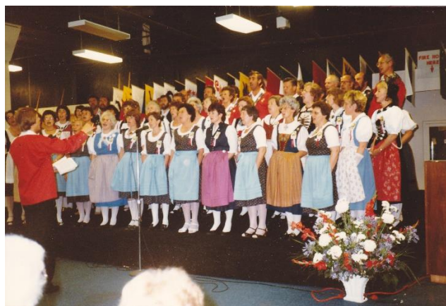
US Trip with the Swiss Choir Swiss Family Maute in 1974