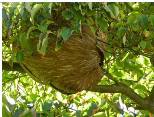
Natures' Miracle: Hornets' Nest, Sept. 11, 2017 in Lynn Valley, North Vancouver