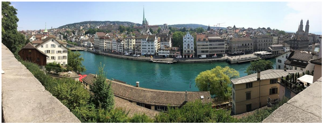
Panorama Picture from the Lindenhof in Zuerich, July 2017

Swiss Society of Vancouver P.O.Box 32021 Walnut Grove Langley, BC V1M 2M3