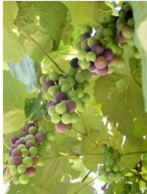
Tessiner Trauben; Clips