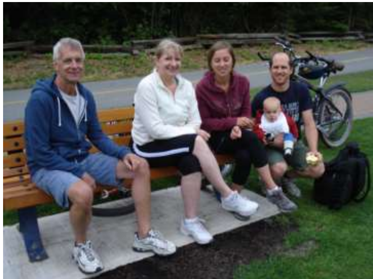
July bike-ride in Whistler