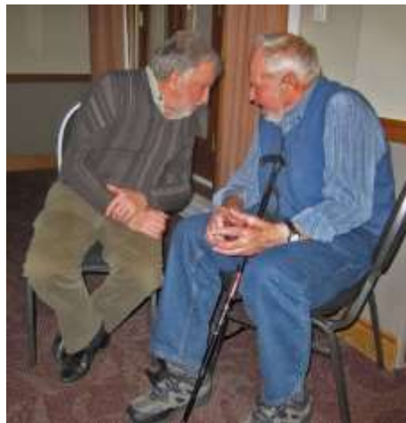
Two friends lost in past days