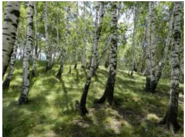
Birch Tree Forest in Val Colla Ticino